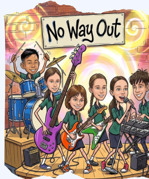
"NO WAY OUT"